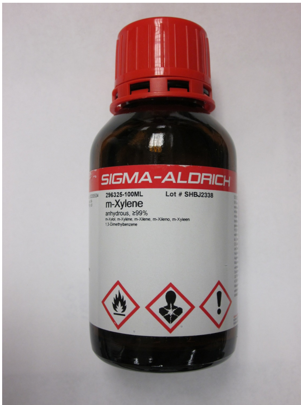
Figure 2: m-Xylene in Sigma-Aldrich container.