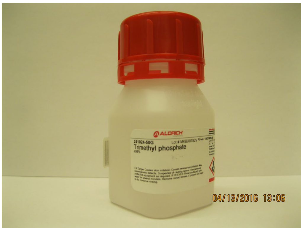
Figure 2: Trimethyl phosphate in Aldrich container for MIR measurements.