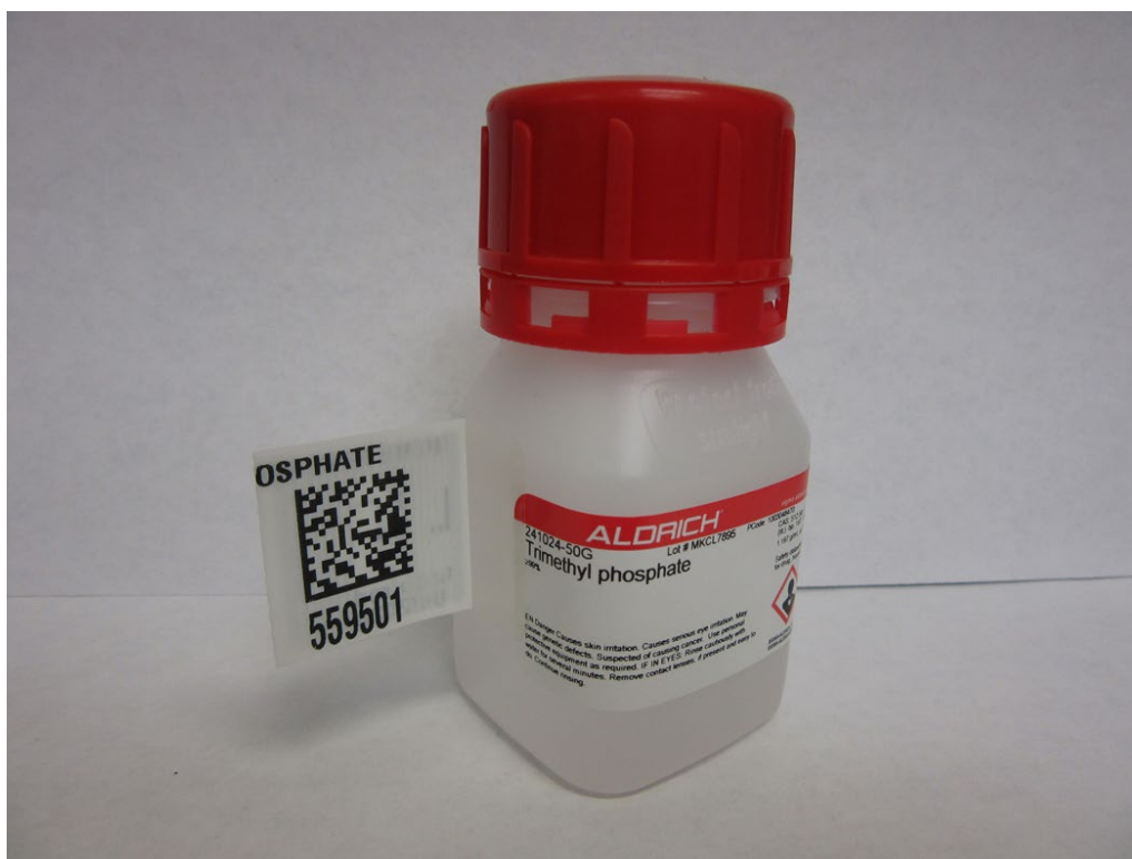
Figure 3: Trimethyl phosphate in Aldrich container for NIR measurements.