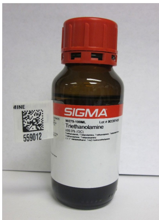
Figure 3: Triethanolamine in Sigma container for NIR measurements.