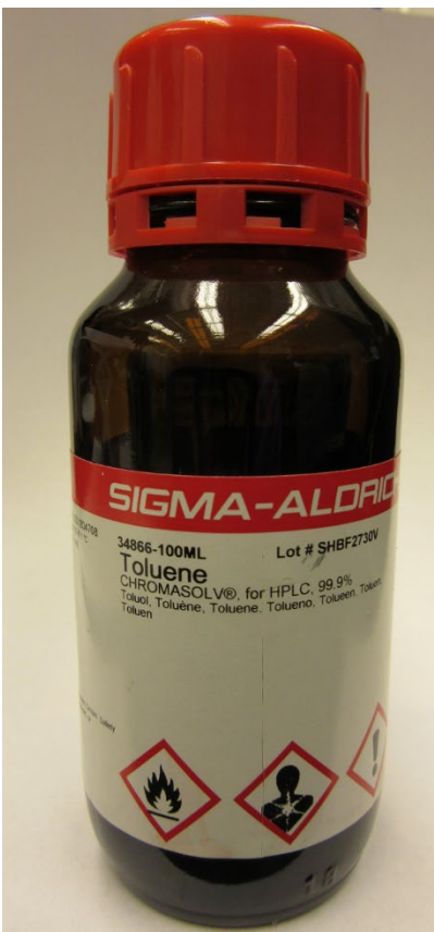
Figure 2: Toluene in Sigma-Aldrich container for MIR measurements.