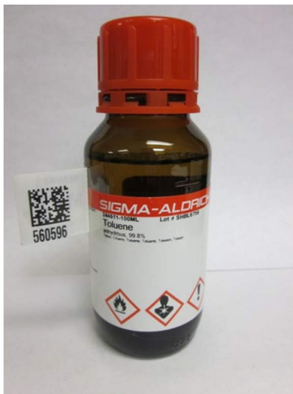
Figure 3: Toluene in Sigma-Aldrich container for NIR measurements.