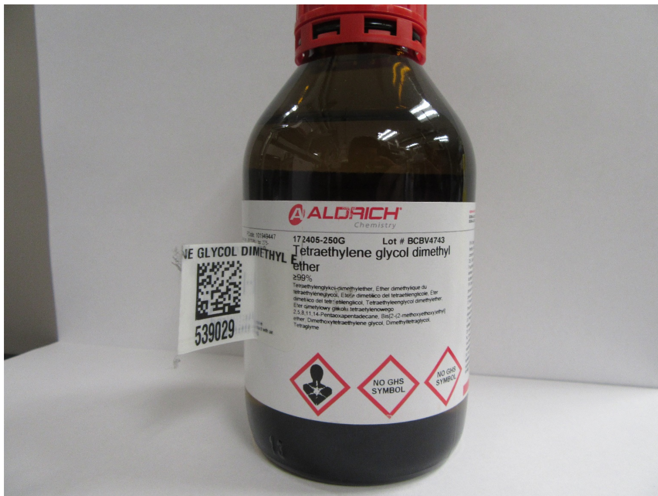
Figure 2: Tetraglyme (Tetraethylene glycol dimethyl ether) in Aldrich container.