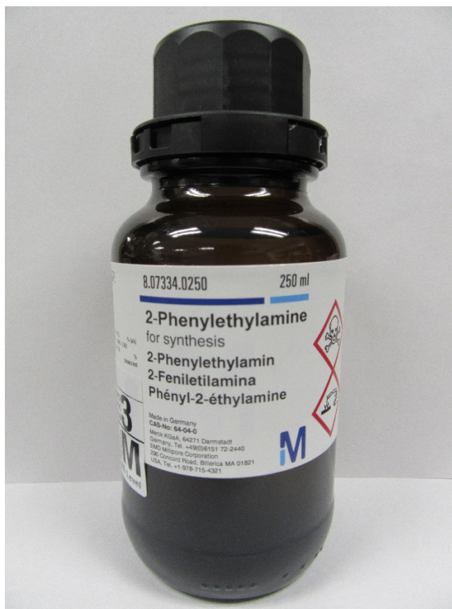
Figure 2: 2-Phenylethylamine in EMD Millipore container.