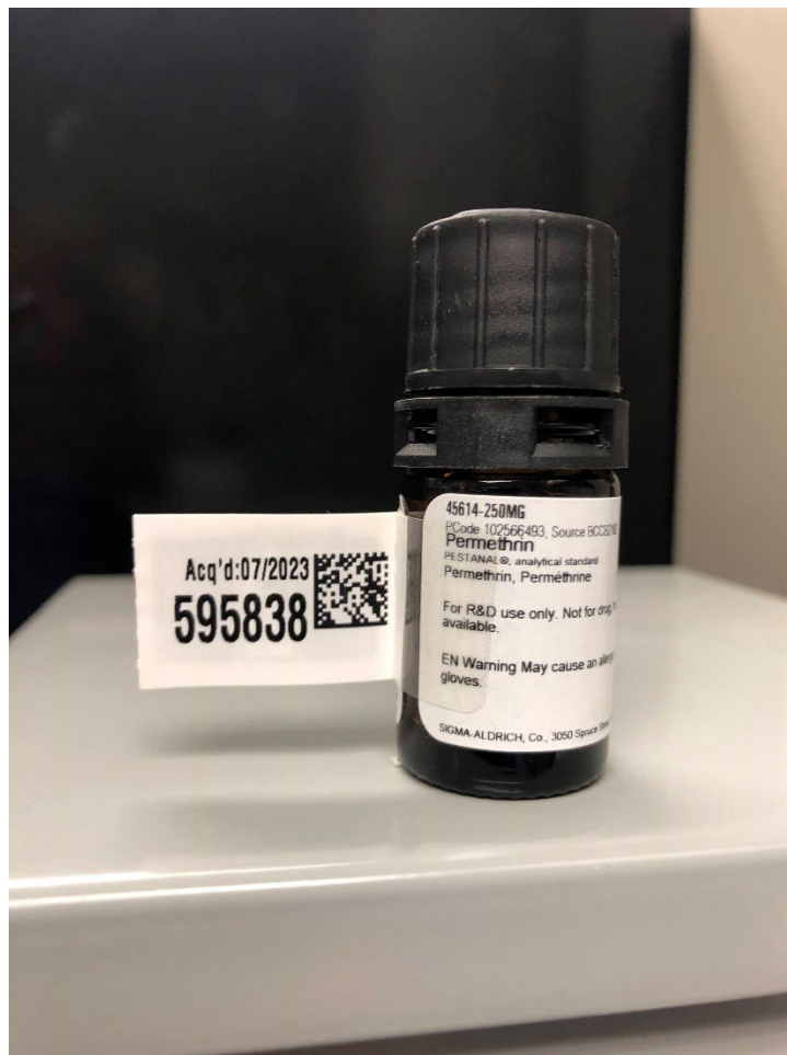
Figure 2: Permethrin in Sigma-Aldrich container for NIR and MIR measurements.