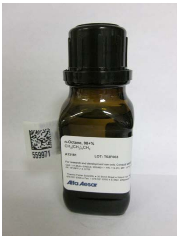
Figure 3: Octane in Alfa Aesar container for NIR measurements.