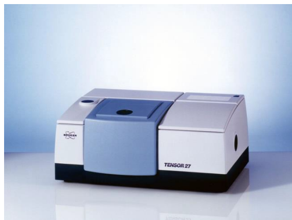
Figure 1: The Bruker Vertex 70 FTIR (a) and Tensor 27 FTIR (b).