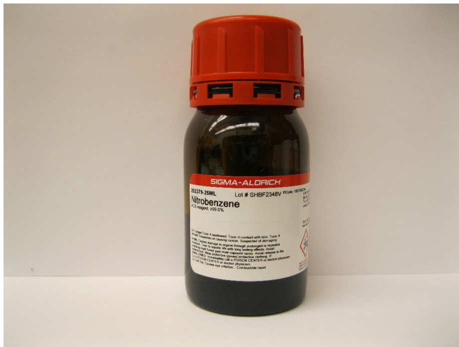
Figure 2: Nitrobenzene in Sigma-Aldrich container for MIR measurements.