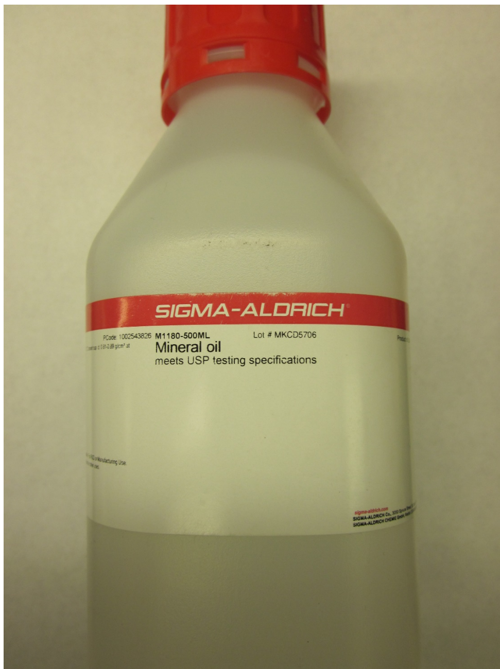
Figure 2: Mineral oil in Sigma-Aldrich container.