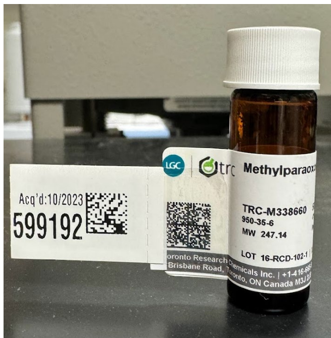
Figure 2: Methyl paraoxon in TRC container for NIR and MIR measurements.