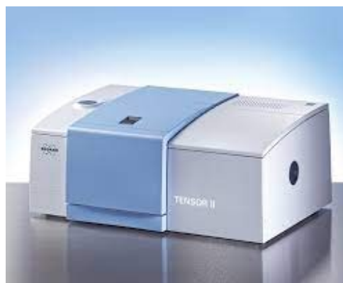
Figure 1: The Bruker Vertex 70 FTIR (a) and Tensor II (b).