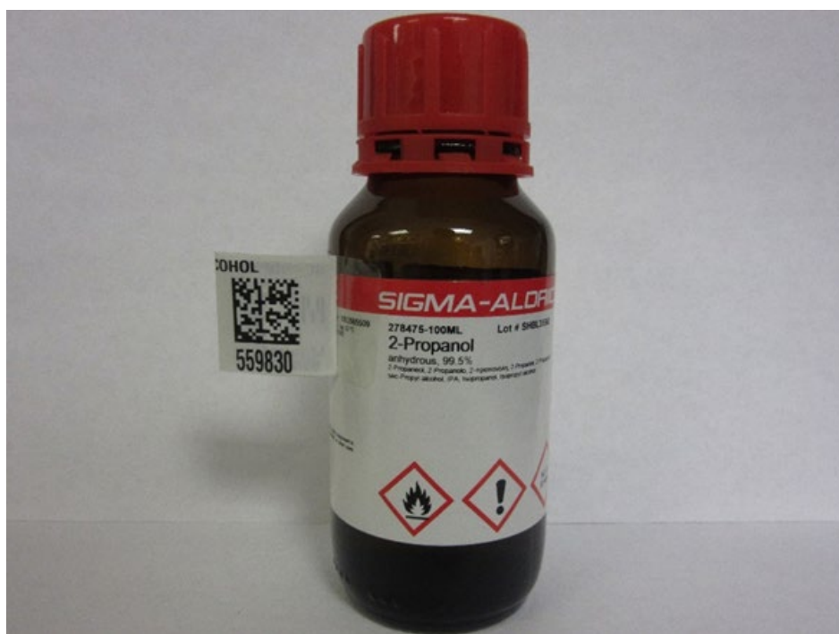
Figure 3: Isopropanol in Sigma-Aldrich container for NIR measurements.