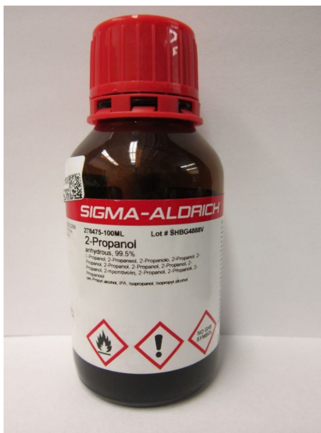
Figure 2: Isopropanol in Sigma-Aldrich container for MIR measurements.