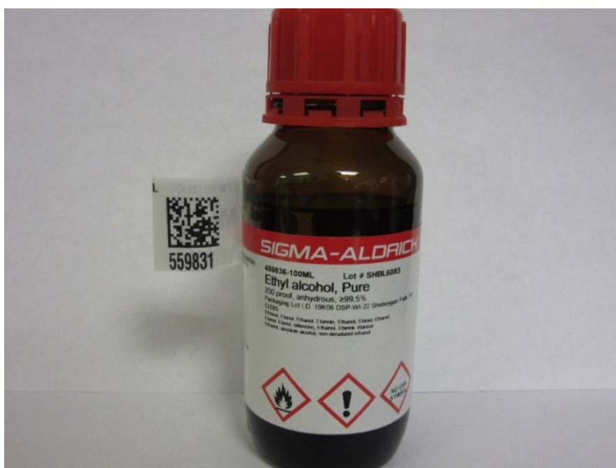
Figure 3: Ethanol in Sigma-Aldrich container for NIR measurements.