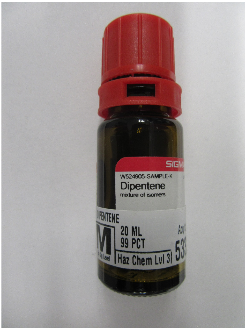
Figure 2: Dipentene in Sigma-Aldrich container.