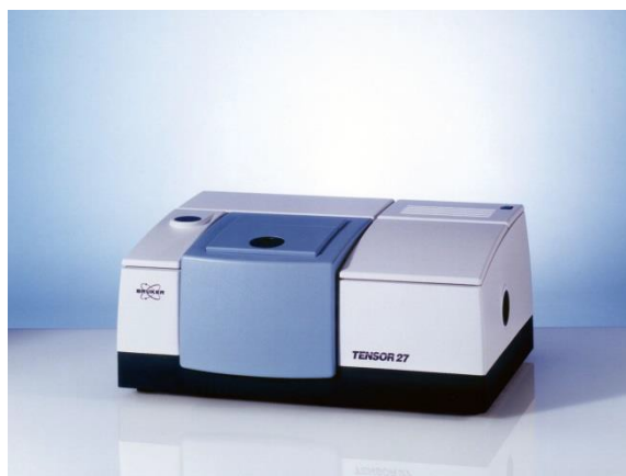
Figure 1: The Bruker Vertex 70 FTIR (a) and Tensor 27 FTIR (b).