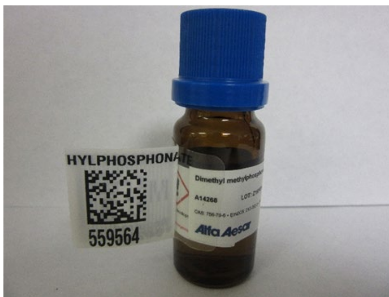
Figure 3: Dimethyl methylphosphonate in Alfa Aesar container for NIR measurements.