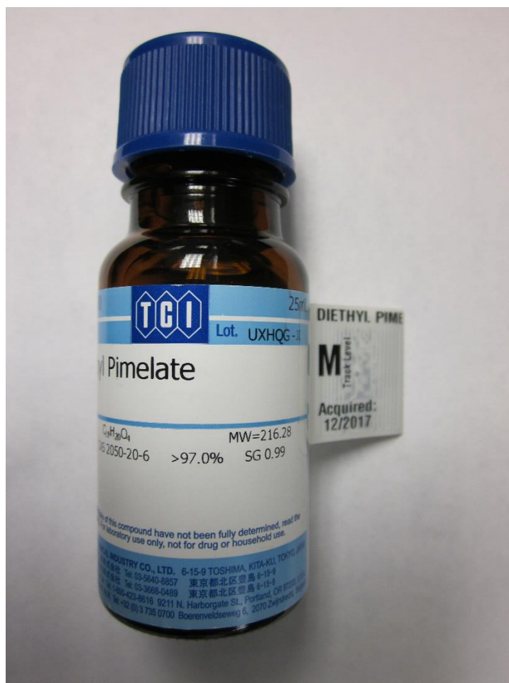
Figure 2: Diethyl pimelate in Tokyo Chemical Industry container.