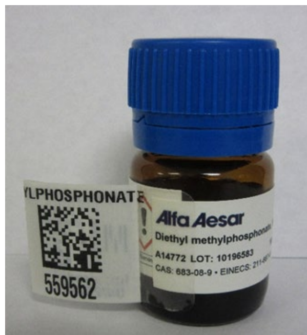
Figure 3: Diethyl methylphosphonate in Alfa Aesar container for NIR measurements.