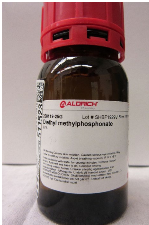
Figure 2: Diethyl methylphosphonate in Aldrich container for MIR measurements.