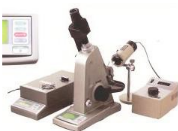
Figure 1: The Bruker Vertex 70 FTIR (a) and Abbe refractometer (b).