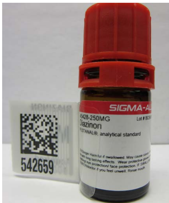
Figure 2: Diazinon in Sigma-Aldrich container.