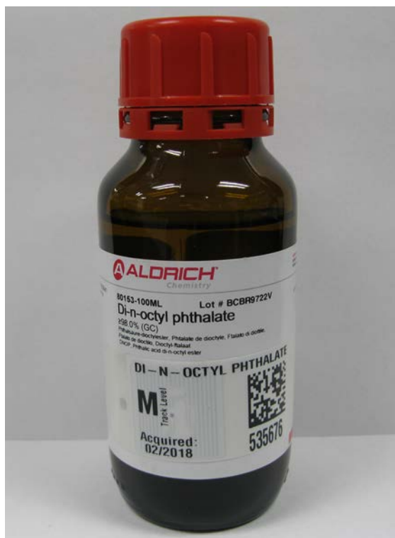
Figure 2: Di-n-octyl phthalate in Aldrich container.