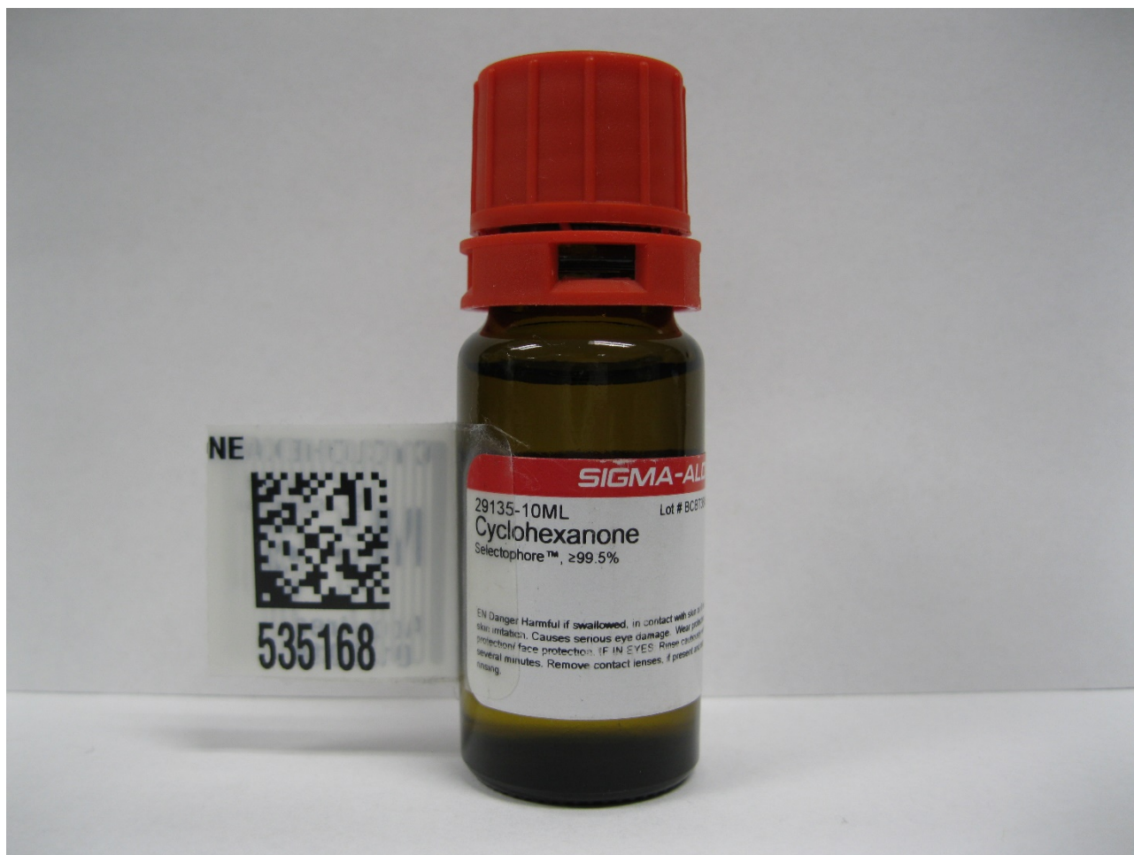
Figure 2: Cyclohexanone in Sigma-Aldrich container.