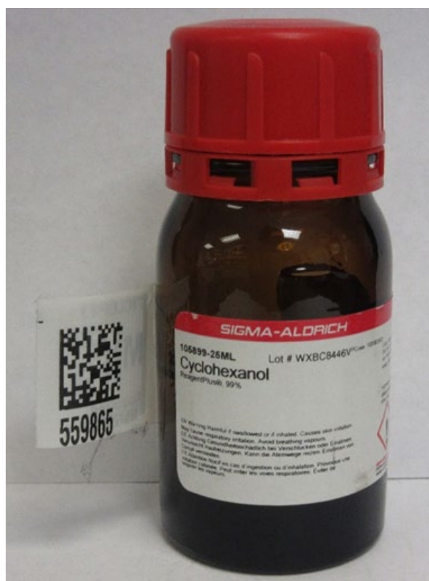
Figure 3: Cyclohexanol in Sigma-Aldrich container for NIR measurements.