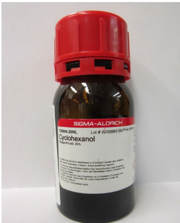
Figure 2: Cyclohexanol in Sigma-Aldrich container for MIR measurements.