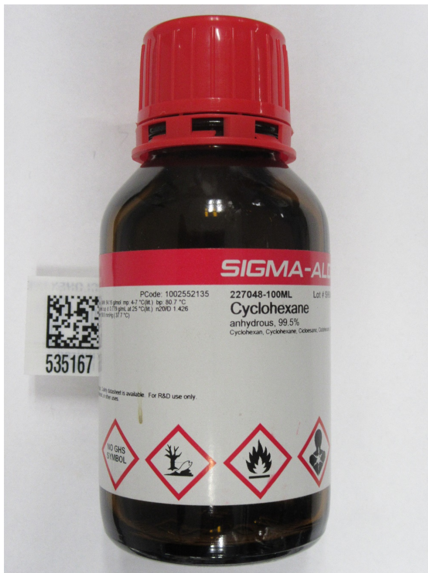
Figure 2: Cyclohexane in Sigma-Aldrich container.