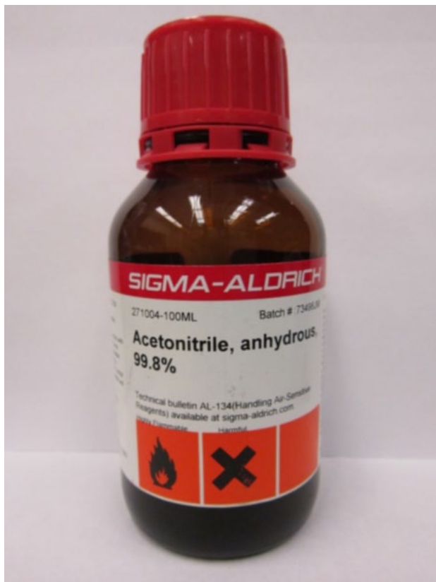
Figure 2: Acetonitrile, anhydrous in Sigma-Aldrich container for MIR measurements.