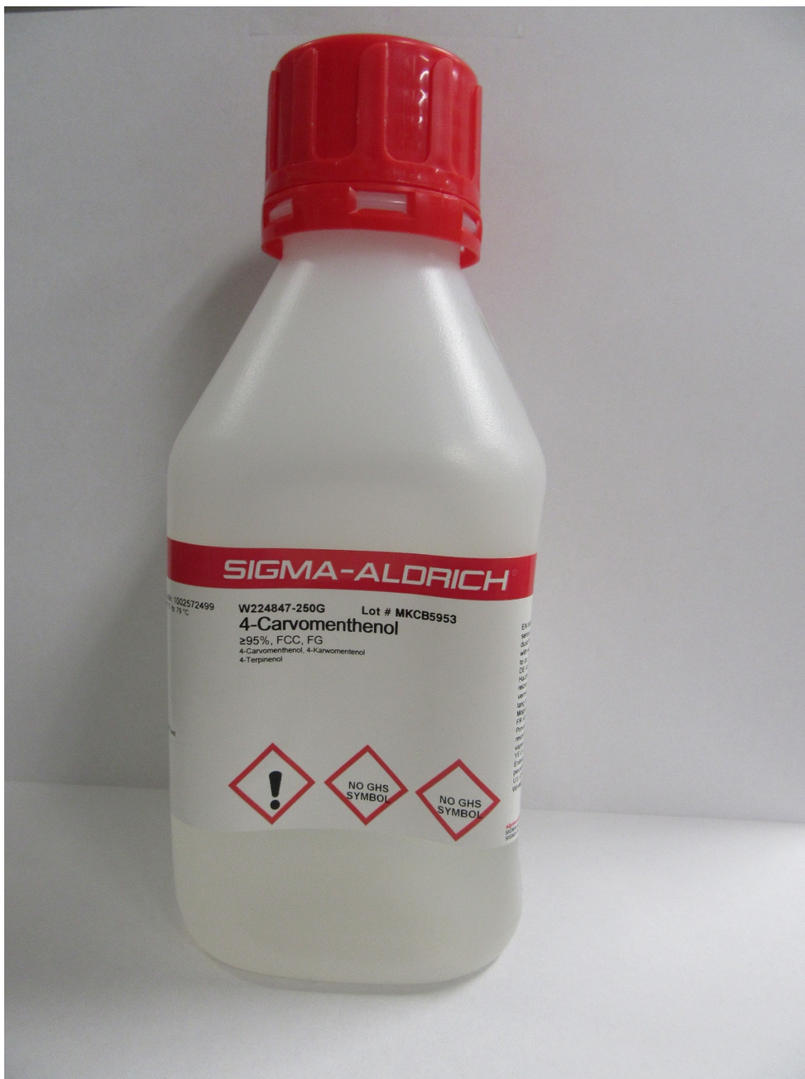
Figure 2: 4-Carvomenthenol in Sigma-Aldrich container.